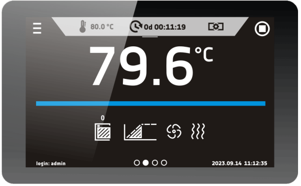
Smart PRO - preview screen